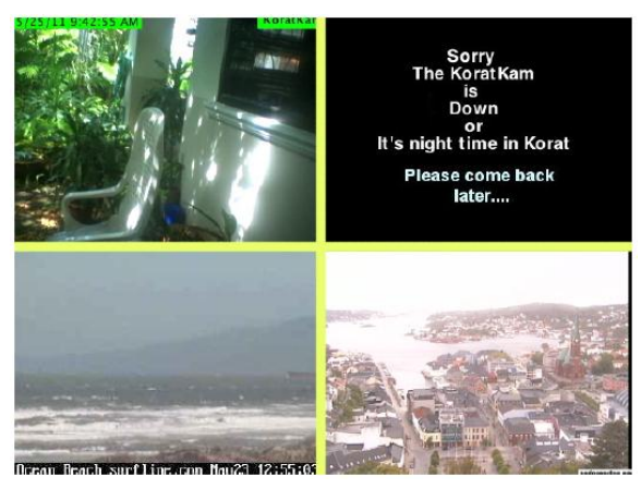
Figure 7. Difficulties encountered determining the weather manually. a) sky not visible, b) out of service, c) low image quality, d) over exposure.

The classification of fog has a high recall, but low precision. That is, only one foggy image is incorrectly classified as a cloudy image, while several cloudy, partially cloudy and sunny images are classified as foggy images.